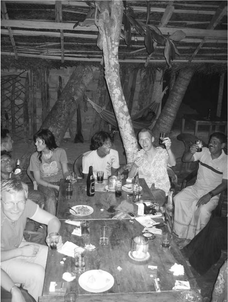
Figure 2: Evening partying and mingling of personnel and their local friends with foreign guests in one of the beach bars, South coast of Sri Lanka, 2006