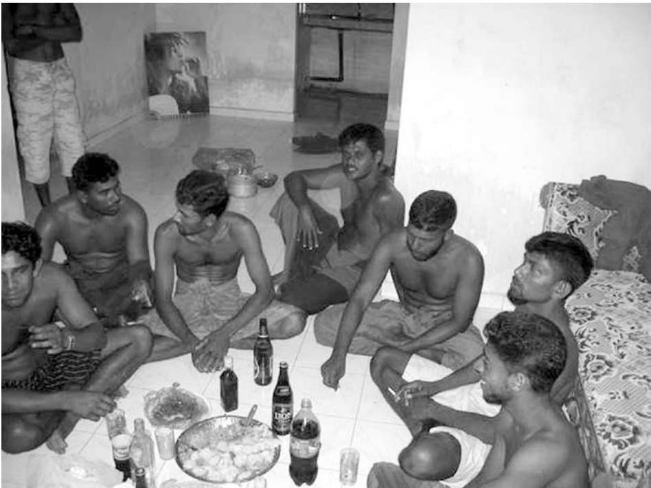
Figure 3: A group of fishermen relaxing after a working day in the open seas at their “meeting centre”; South coast of Sri Lanka 2006, photo by the author

I joined a French traveller, Simon, and two German travellers, Adelle and Ema, that headed from Kandy to one of the administrative centres in the South, eight hours by train. On arrival, Simon took us to a renovated house not far away from a large empty beach on the outskirts of the town. The one-storey house had been damaged by tsunamis in 2004 and consequently repaired/reconstructed into a two-storey house with the support money from Switzerland. The ground floor was intended for tourism accommodation facilities, but the oldest son of the family, Samith, who earned substantial money with tuna fishing, used it as a meeting point of his co-workers (a group of young high sea fishermen) and their friends.