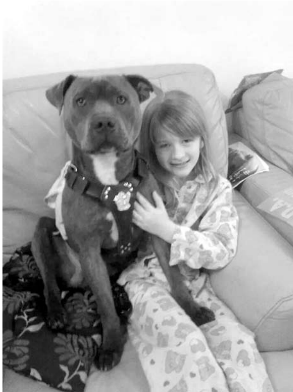
Figure 3: Photo used in a lost “staffie” appeal, resulting in 478 “Shares” by readers

Whilst some might have been put off by the size of the dog, and been concerned about encountering the dog on the streets, no one in the string of comments mentioned this; one called him gorgeous. The story was shared 478 times before he was eventually reunited with his owner. It was not just the fact that people responded favourably, but the consensus they reached as a readership that is significant. Commenting on posts, sharing stories, even simply reading this alternative media (Bruns 2008) make readers feel they are participating and, even when my interviewees admitted they could not always respond to stories such as attending events, they appreciated that it gave them a sense of belonging and positive activity taking place in the neighbourhood. While some of my interviewees were housebound due to poor health, old age, or felt excluded from social cliques such as mothers at the school gates, online local media allowed them to feel included, informed and part of a conversation. Of course, there is potential for this to form an online clique in itself, where newcomers may feel it is not their place to visibly disagree with any common consensus reached, or even participate at all.