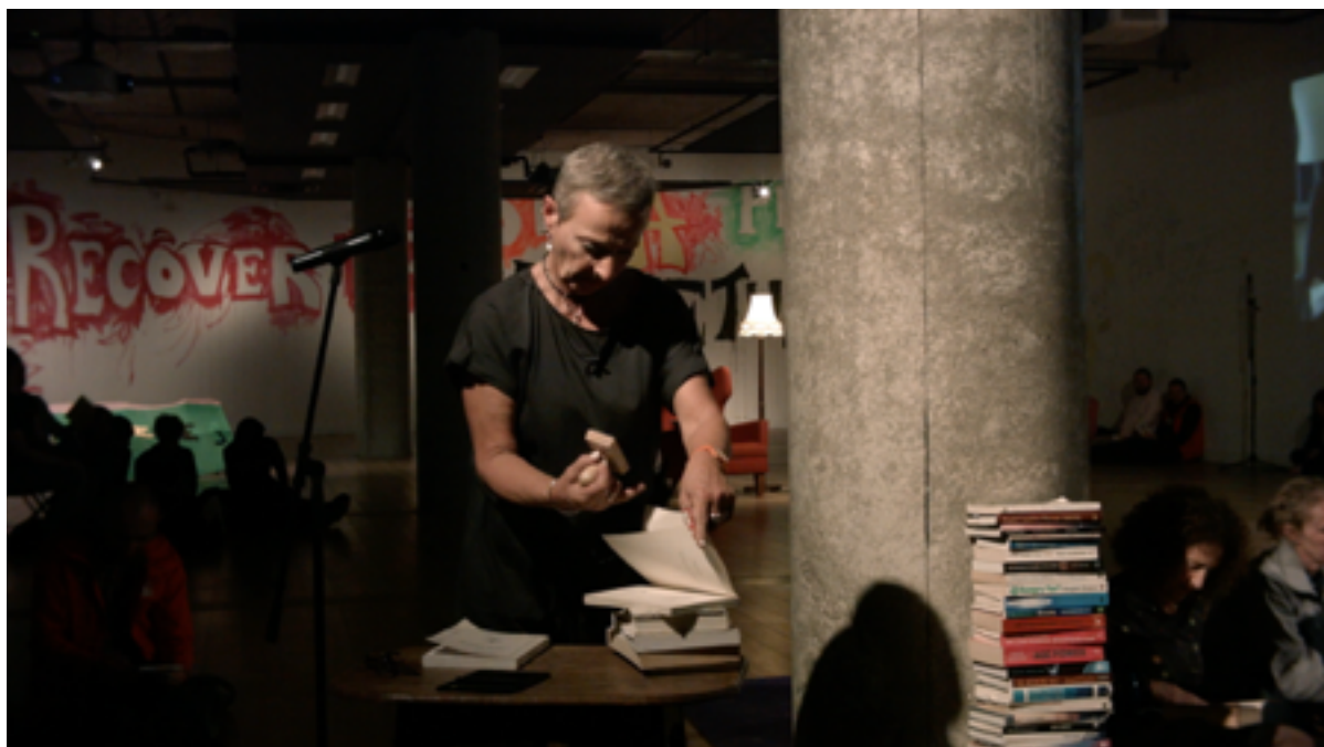
Image 2: Adele Performance at HOME. Still, My Recoverist Family 2017

The X Factor diet, The C-word. Reverse Ageing Barefoot Doctor's Invincibility Training. Rapid Cognitive Therapy The Yoga Year Rational Recovery, The New Cure for Substance Addiction Barefoot Doctor's Urban warrior, A Spiritual Survival Guide. Light Emerging, The Union of Bliss and Emptiness.